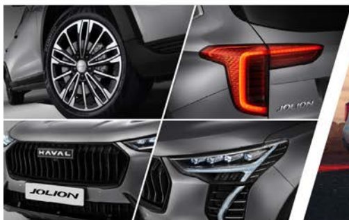
Fashionable and Dynamic Exterior Design