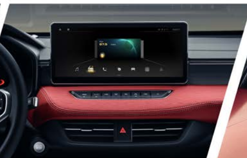
12.3-Inch smart Touch Screen Resolution up to 1280 * 720