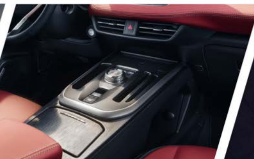
Wireless charging+Wired Apple CarPlay® & Android Auto™