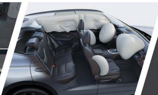
6 Omni-Directional Airbags