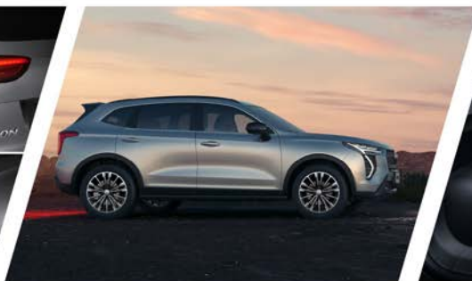
2700mm Long Wheelbase